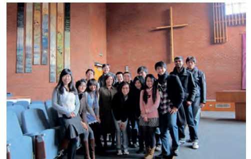
Mandarin Bible Study Group

St Peter's House University Precinct Oxford Road Manchester M13 9GH 0161 275 2894 sph.reception@manchester.ac.uk www.stpeters.org.uk