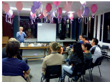
International Friend's Night